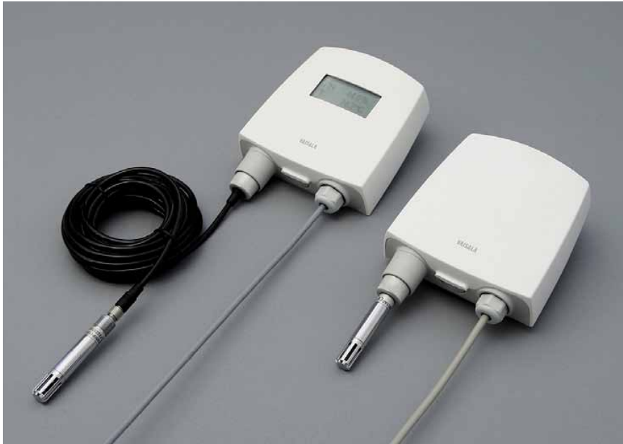
The HMT120/130 with and without a display.

The Vaisala HUMICAP® Humidity and Temperature Transmitters HMT120 and HMT130 are designed for humidity and temperature monitoring in cleanrooms and are also suitable for demanding HVAC applications.