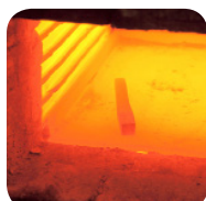
Kilns and furnaces