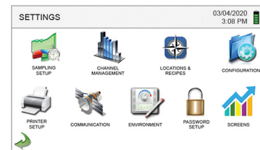
Icon Driven Menus for Ease-of-Use