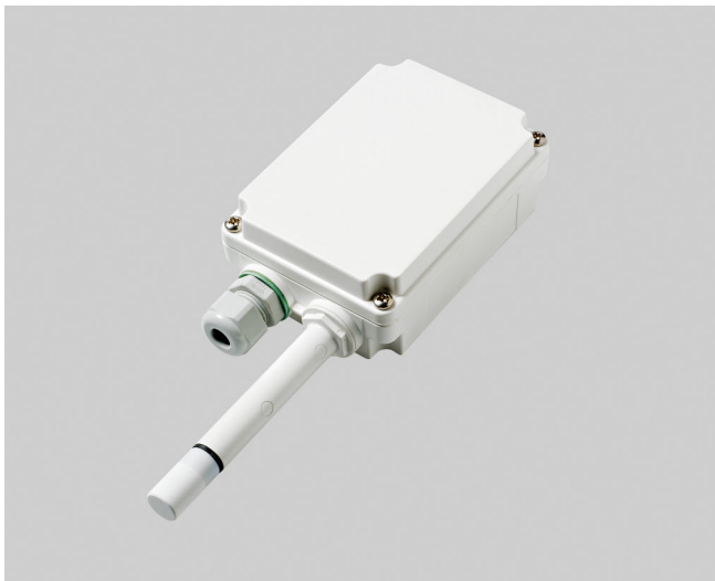
HMW110/112 wall-mount RH+T transmitters with IP65 rating