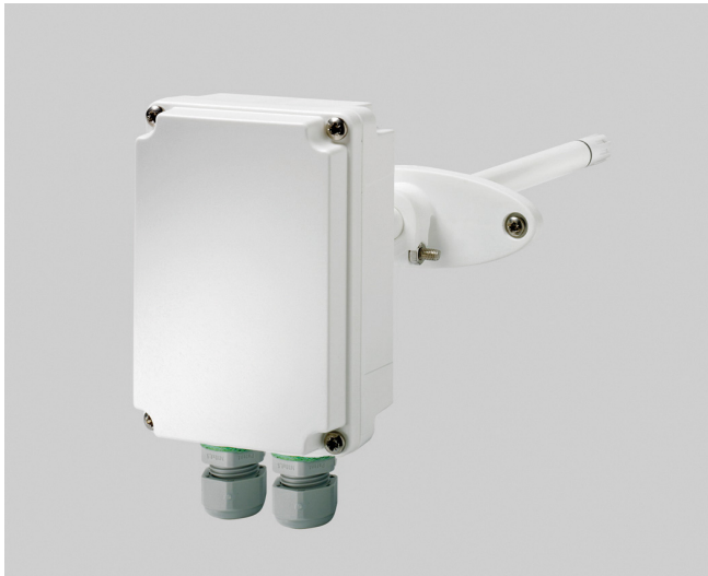
HMD110/112 RH+T transmitters for ducts