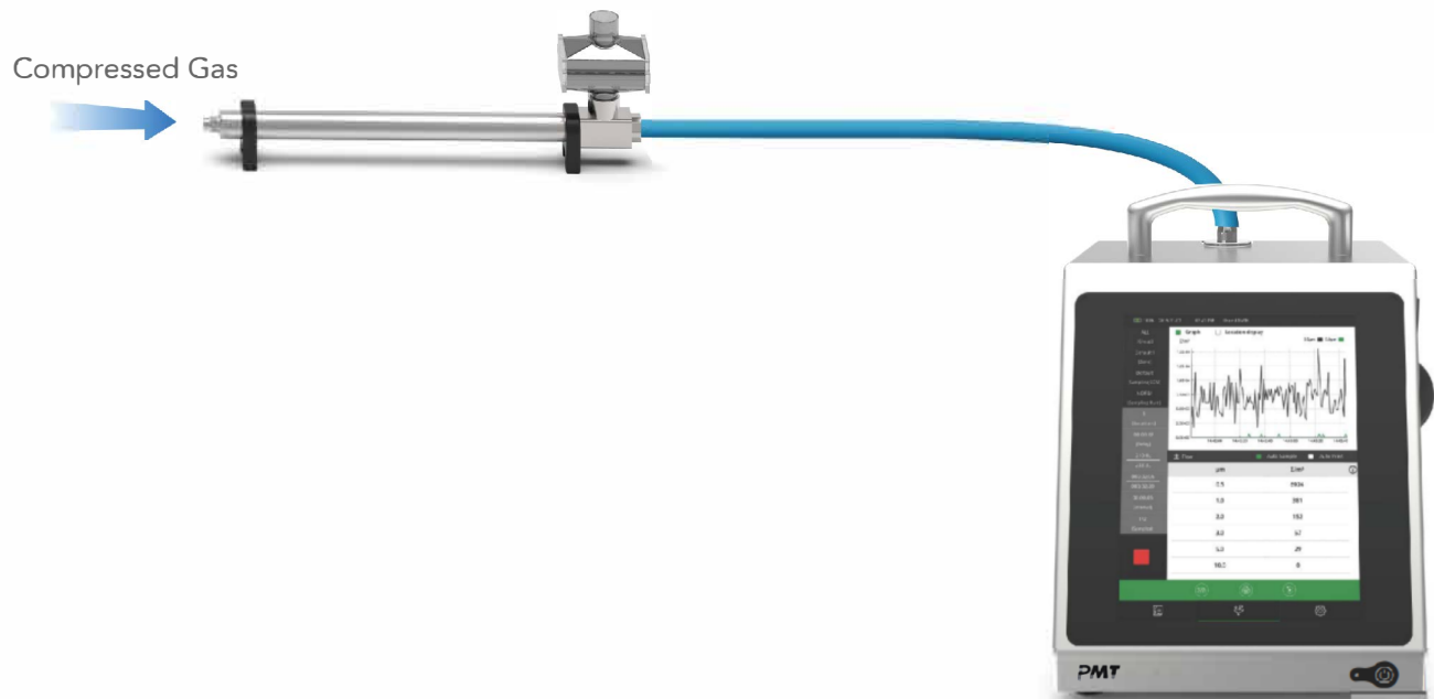
Application 1: Compressed gas particle detection

Compressed gas is decompressed to atmospheric pressure by the High Pressure Gas Diffuser and transported to the back-end sampling/detection device for sampling or detection.