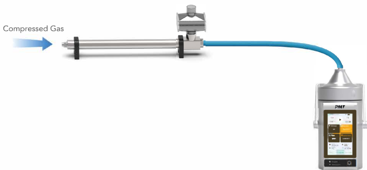
Application 2: Compressed gas microbial detection