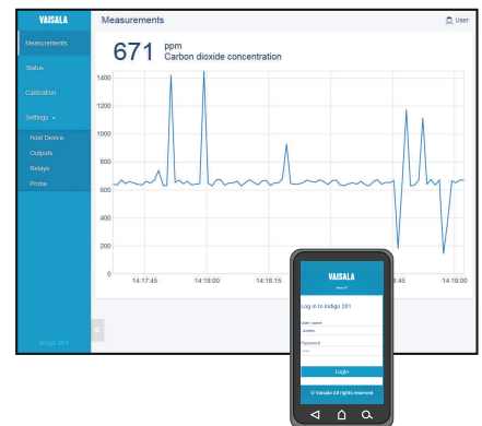
Wireless Configuration Interface Example (Desktop and Mobile Views)

The surface of the Indigo 200 enclosure is smooth, which makes it easy to clean. It is also resistant to dust and most chemicals, such as H 2 O 2 and alcohol-based cleaning agents.