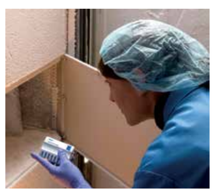
Ideal for mapping ICH Stability areas, Freezers, Refrigerators, Incubators and Warehouses.