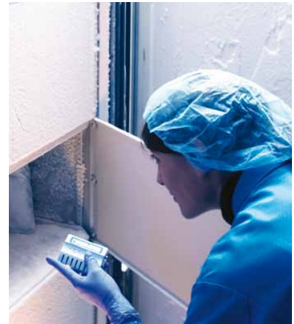
Ideal for mapping ICH Stability areas, Freezers, Refrigerators, Incubators and Warehouses.

"The Vaisala validation system reduced our setup time for temperature mapping by at least 80 %." - Stephanie Cowan Validation Specialist