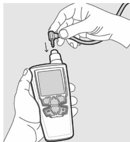
Snapping a connector to the indicator HM40 to read the measurement results.

Vaisala HUMICAP® Structural Humidity Measurement Kit SHM40 offers an easy and reliable solution for humidity measurements in concrete and other structures.