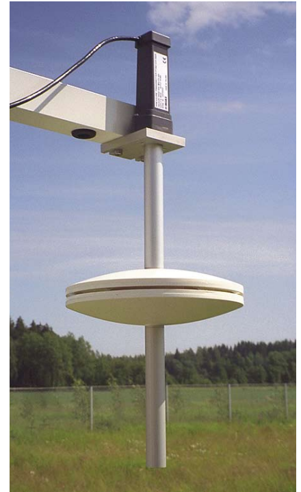
The SPH10/20 is easy to install and connect. In the picture, a SPH10 is connected to a PTB210 barometer.

The SPH10/20 static pressure heads are easy to install and disassemble, service and clean – even at the installation site. Vaisala BAROCAP® Digital Barometer PTB210 can be installed directly on top of the SPH10/20 static pressure heads. Other barometers can be connected to the heads with pressure tubing. SPH10 and SPH20 are a perfect pair for all Vaisala barometers. They ensure an accurate and reliable measurement in all weather conditions.