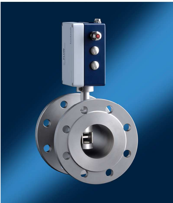
VA DI ... ZG1