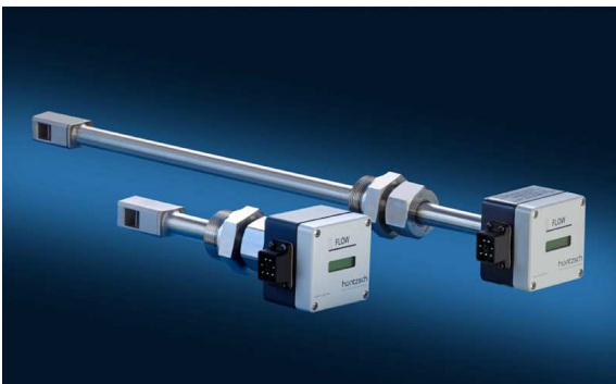
VA40 ... ZG7