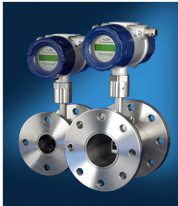
VA DI ... ZG1 Ex-d