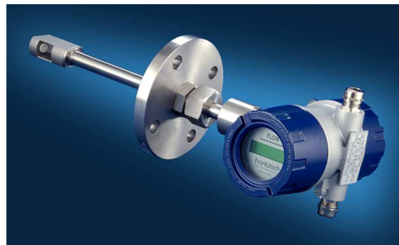
VA40 ... ZG8 Ex-d